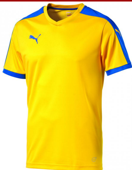
team yellow-puma royal

Material: 100% Polyester microfibre; Double knit: Pique; 130 g/m 2 ; Pre-heat setting, Bio-based Wicking Finish. Details: The Shirts of legends! Used by the games greatest, worn by you. PUMA Cat brandings to righthand chest and sleeves. PUMA Form Stripe insert sleeve panels. 1x1 Rib sleeve cuffs for fit and comfort. Mesh back panel from comfort and temperature control. Crew Neck. Double Knit Polyester Pique fabric. Clean, classic and distinctly Football.