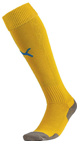
team yellow-puma royal

73% polyester 15% cotton 12% elastane Puma Cat branding, knitted sock to front, contrast colour welt, knitted mesh for breathability cotton heel and toe for comfort ankle brace for stability.